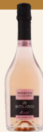
PROSECCO DOC TREVISO Millesimato Rosé Brut

A sparkling wine from our vineyards in the province of Treviso and made using the Charmat Method. Fresh, smooth and balanced, this Extra Dry has won over the palates of the many international juries that have awarded it numerous prizes. Its persistence is driven by a tanginess that characterises the finish.