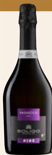
PROSECCO DOC NINE Dry

A very classy Prosecco with aromas of fresh fruit, biscuit bread and flowers ranging from acacia to lily and lily of the valley. Subtle hints of aromatic herbs. Delicate, harmonious and pleasantly persistent on the palate.