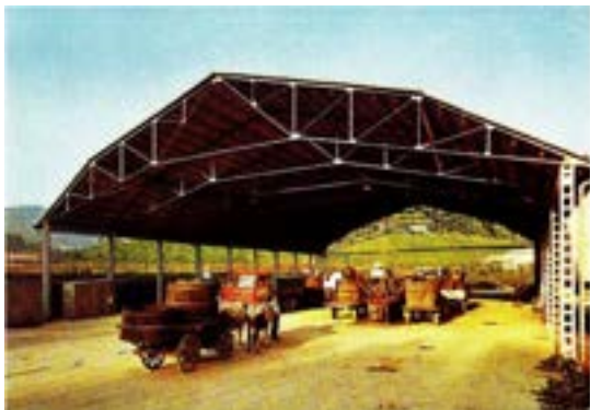
Facilities The delivery of the grapes in the 70s. Collection center, vinification, sparkling and bottling plant in Pieve di Soligo.

Today, our 600 members devote their time and efforts to the cultivation of 1,200 hectares of vineyards where approximately 85% of the grapes produced are of the Glera variety (Prosecco) and the remainder is Pinot Grigio, Chardonnay, Sauvignon Blanc, Merlot, Pinot Noir, Cabernet Franc, and Sauvignon. In 2019, selected vineyards were planted with Johanniter and Sauvignier Gris vines, hardy varieties that demonstrate our growing commitment to sustainable viticulture .