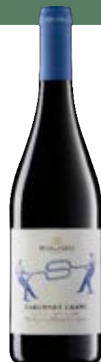
CABERNET FRANC Marca Trevigiana IGT

The grapes come from our vineyards north of Treviso they develop their aromatic and phenolic components to the full. A balanced wine with soft tannins and a good freshness of flavour. On the nose it offers aromas of plum and cranberry, floral notes of violet and a hint of vanilla.