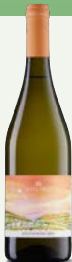
SOUVIGNIER GRIS Veneto IGT

Cod. TSOG1 Grape Souvignier Gris Alcohol 12% vol.