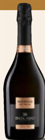
PROSECCO DOC TREVISO Extra Dry

Fresh and elegant with sweet velvety sensations on the palate. Tasty, persistent finish. Suitable for any occasion, perfect with sweet dishes.