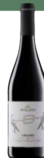
'CESARE' Colli Trevigiani IGT

The grapes are harvested when fully ripe in order for maximum development of the phenolic component. In the winery, fermentation on the skins begins for 15 days in steel vats. This is followed by a minimum of 6 months' ageing in steel tanks. A part then rests in large casks for 5 months.