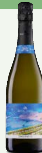
JOHANNITER Spumante Brut

Intense and straight, with scents of sweet spices, like vanilla, clove and liquorice, together with citrus-like nuances of citron and lemon on a background of quince. Dry, warm and cosy with a spicy finish.